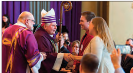
Confirmation

Catholic Educators and Catechists at the annual New Evangelization Convocation